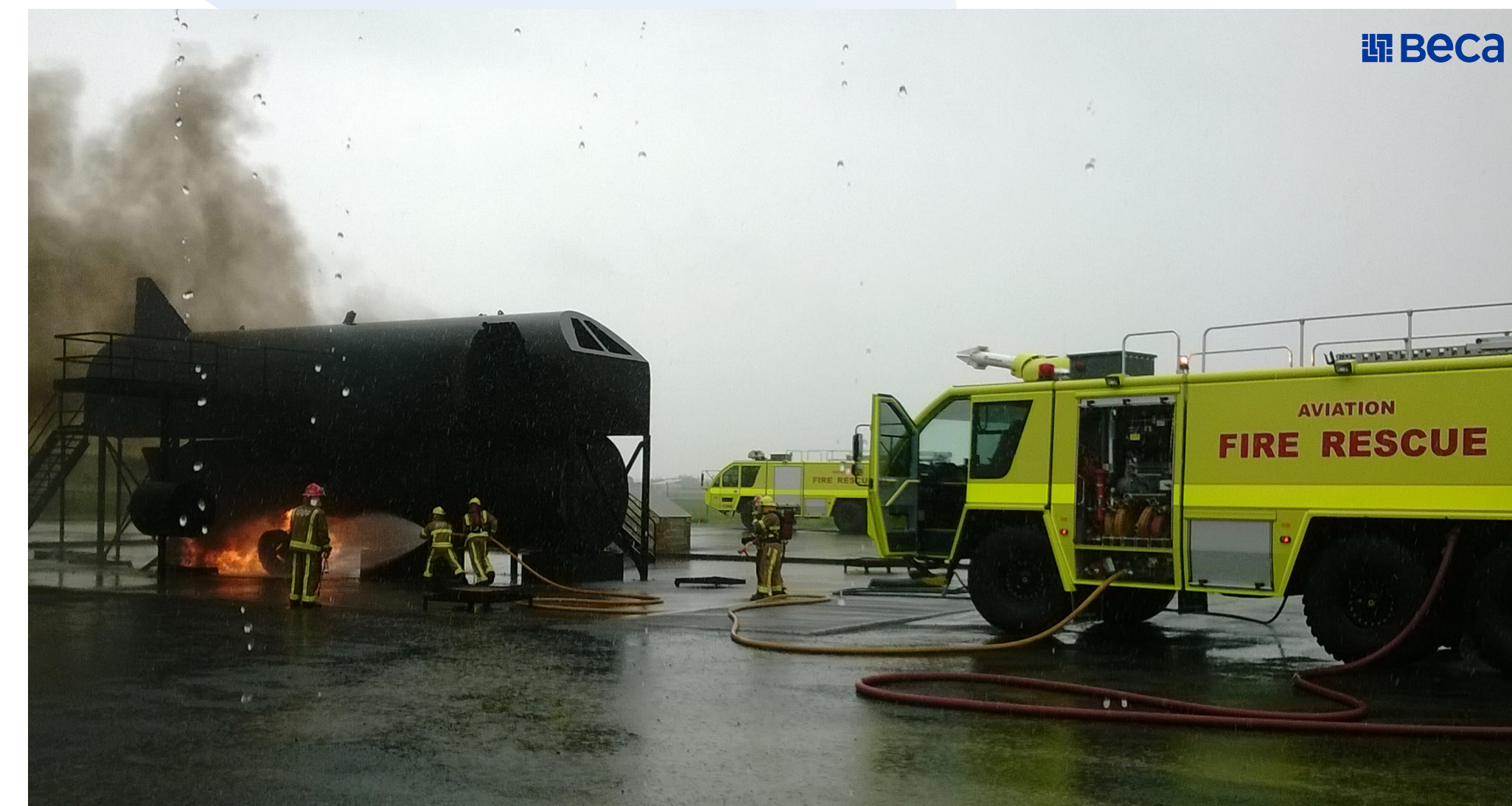
Figure 1: A Hot Fire Training Ground

A lab-scale trial was performed to assess two adsorption products marketed by Ziltek, RemBind™ and RemBind Plus™, as a treatment solution specifically targeting PFASs at levels typically found in wastewater produced by aviation rescue fire fighting training activities (Figure 1).