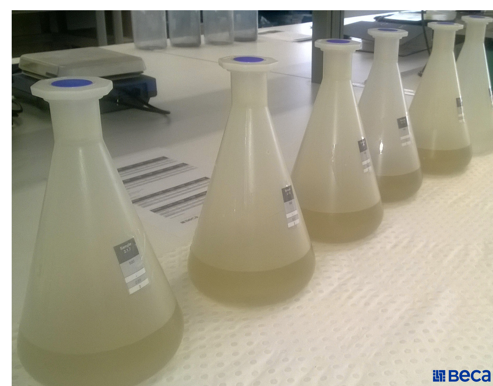
Figure 2: RemBind treatments were stirred in 2 litre flasks for up to 2 hours

Gross hydrocarbons were shown to reduce the adsorption of PFASs onto the RemBind products. It was recommended that any use of RemBind in a PFAS treatment system should include a pre-treatment stage to reduce total recoverable hydrocarbons to levels less than 15 mg/L.