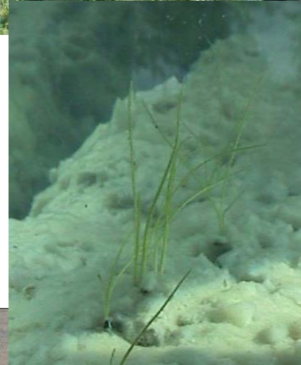
Right: Hard-stemmed Bulrush ( Scirpus acutus ) sown into an inundated environment using SubmerSeed and growing on a substrate of pure AquaBlok®.