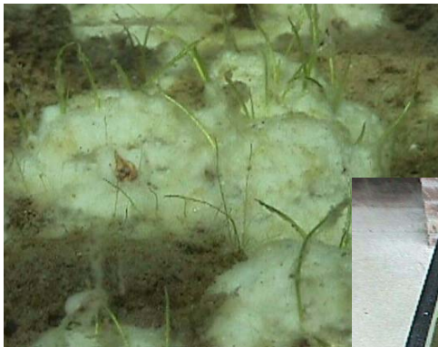
The developmental progression of Common Arrowhead or Duck Potato ( Sagittaria latifolia ) under inundated conditions using SubmerSeed in a controlled greenhouse setting ( above: 21 days after product inundation; right: 57 days; far right: 100 days after product inundation).