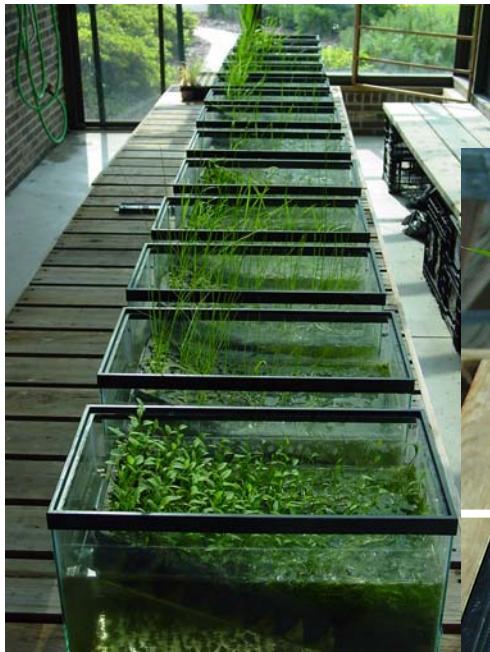
Left: Germination and early development greenhouse studies conducted with SubmerSeed to investigate growth preferences of freshwater emergent wetland plant species along a water depth gradient.