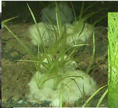
Mud plantain ( A. plantago-aquatica ) under inundated conditions ( above: 21 days after SubmerSeed application – leaflets 1-2”; right: 35 days after application – leaflets 2-3”).