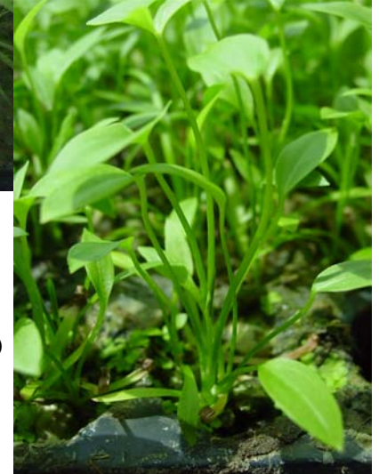
Right: Mud plantain ( A. plantago-aquatica ) seedling (4-5”) grown using SubmerSeed (100 days following product placement).