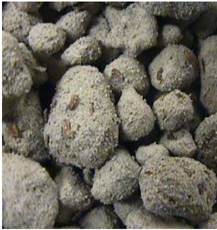
Above: Dark, scale-like mud plantain ( Alisma plantago-aquatica ) seeds are visible in this close-up of dry product (typical approximate size ¼ - ½”).