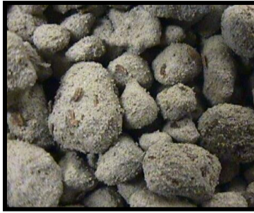
Photograph 1. Close-up of typical SubmerSeed particles (approximate size: ¼ - ½")

Product coverage rates will vary depending on the species composition incorporated into the material and the site-specific requirements for the project. However, a rate of 1,500 to 2,500 pounds of dry product per acre (0.03 – 0.06 lbs/SF) is a reasonable approximation of the quantity of material needed for a typical application.