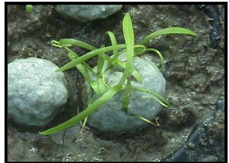
Photograph 2. Close-up of early germination